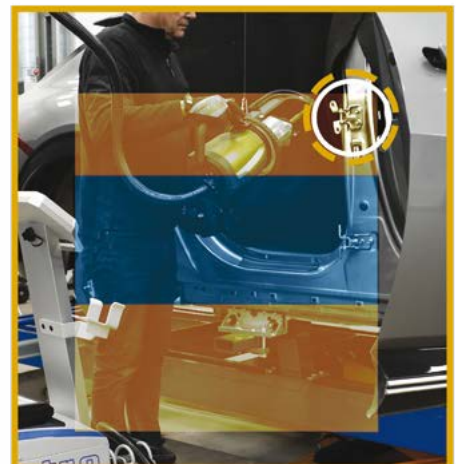
Outside Ergonomic Window